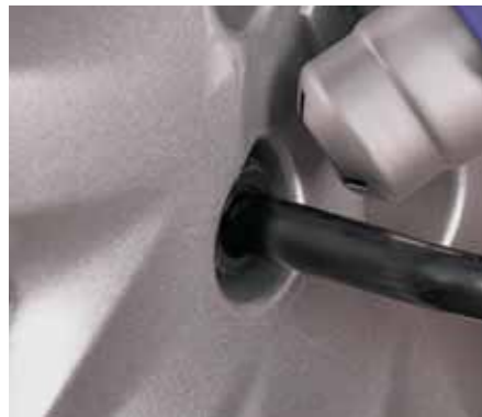
Loosening of screws PIC PRO PLUS