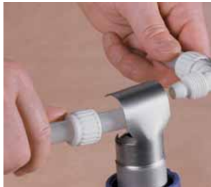
Forming PIC PRO PLUS