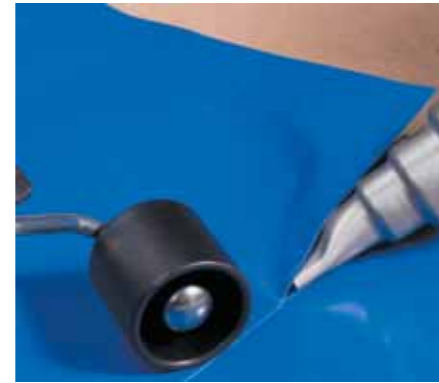
Repair welding PLUS