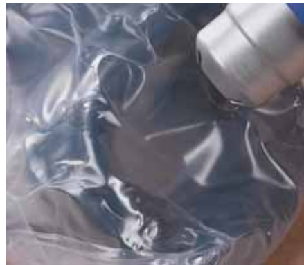
Shrinking PIC PRO PLUS