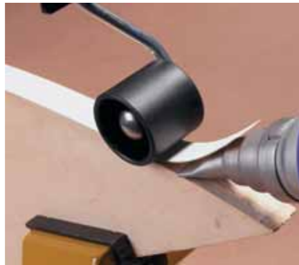
Edge banding PLUS