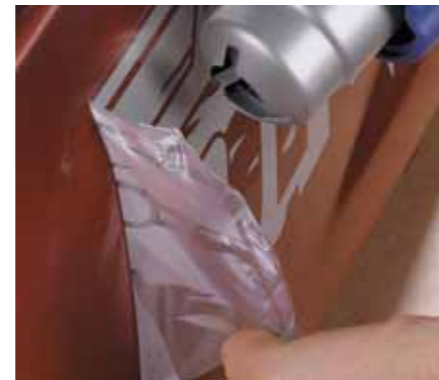
Remove of stickers and films PIC PRO PLUS