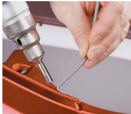
Pendulum welding PLUS