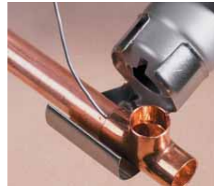
Soldering of copper tubes PRO PLUS