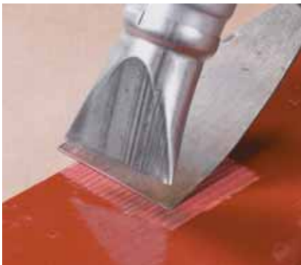
Paint stripping PIC PRO PLUS